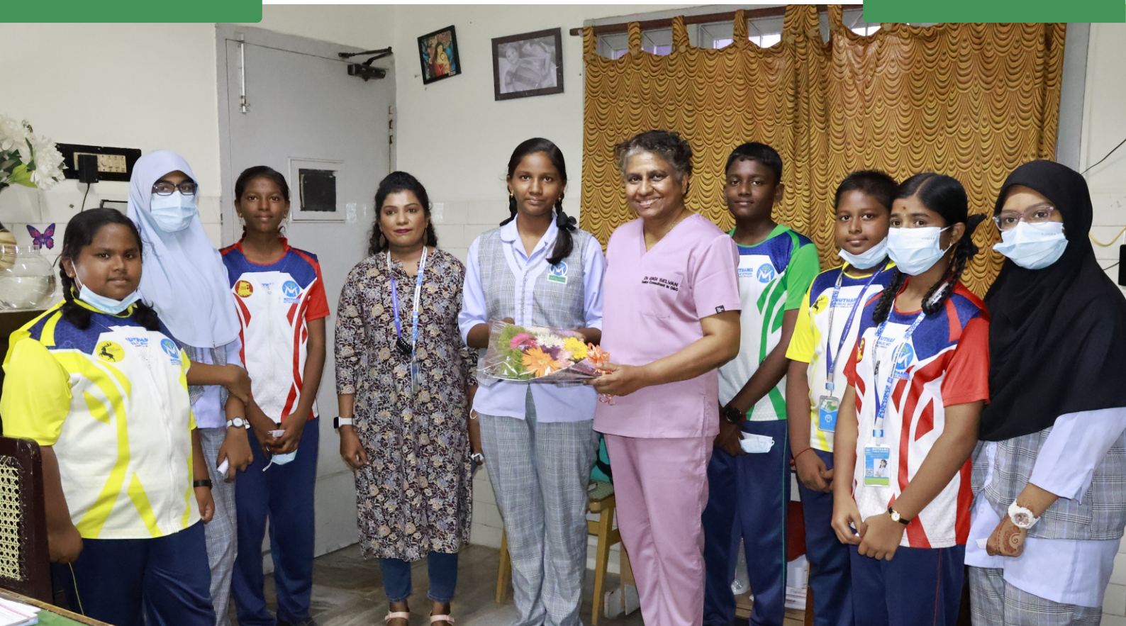
Doctors- the Good Samaritans. "A Life lived for others is a Life"

Student volunteers from Grades VI-XII segregated themselves into three Groups and visited the neighboring Hospitals to honor the doctors on this special occasion "DOCTORS' DAY". Students had one-to-one interaction with the Doctors and clarified all the doubts they had related to Medicine. The Doctors were Awestruck at the Efficacy with which the students interviewed them. With a heavy heart, they left the hospital, with all the dreams and aspirations to be like one of those eminent Doctors. It's a salute to the Guardians of Health who work tirelessly to save lives and bring smiles to our faces!!