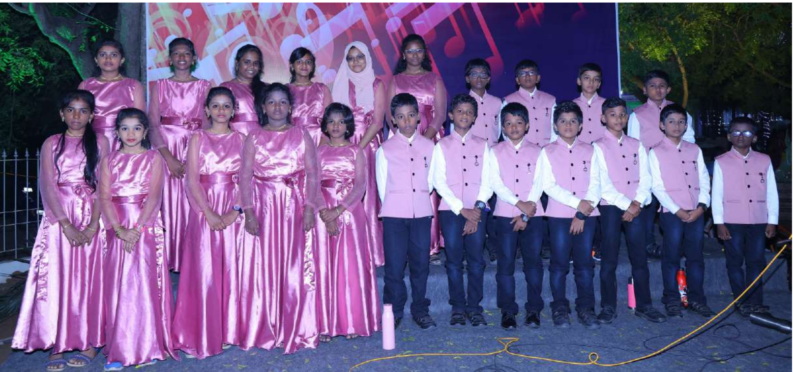
Music brings peace to our body & soul and our MPS Choir team enchanted the audience with their mystical performance.