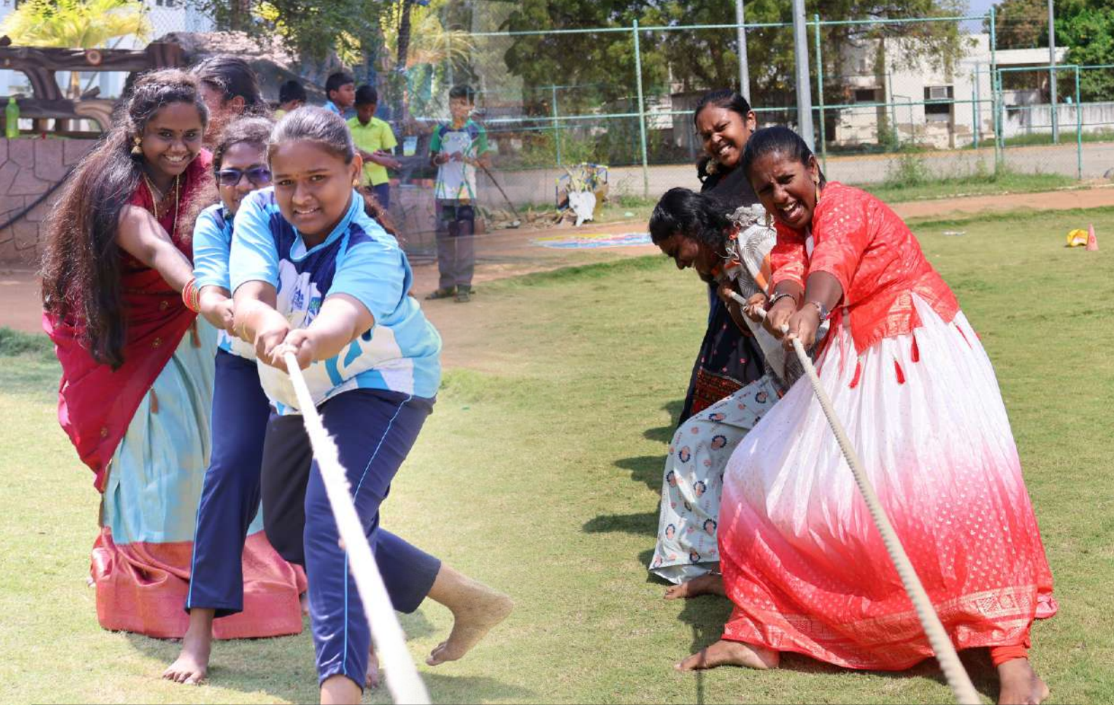
Fun games like tug of war, slow cycle race, Pallanguli, or Pallankuli, a traditional ancient game played in South India, was organized for girls. Boys had kite-flying competition.