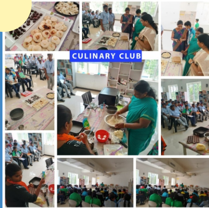
CULINARY CLUB CLUB

Foodies with a passion for cooking and zeal, enthusiastically joined the culinary club. Culinary club students prepared north and south Indian dishes. Varieties of dishes were prepared under the guidance of experienced teachers. After a joyful time of preparing delicious and mouth-watering dishes, students enjoyed having all the prepared food for lunch.